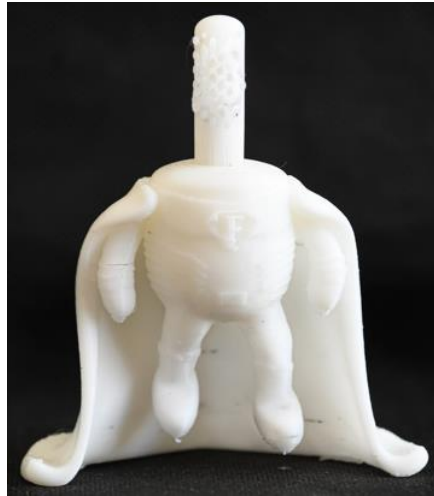
Figure 2. Final Prototype.