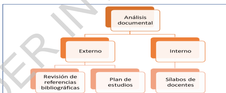
Figure 3. Documentary analysis of the applied formative research.

For the application of data collection regarding the applicability of formative research in the curriculum, the following methodology was used, considering the strategic indicators shown in Figure 4.