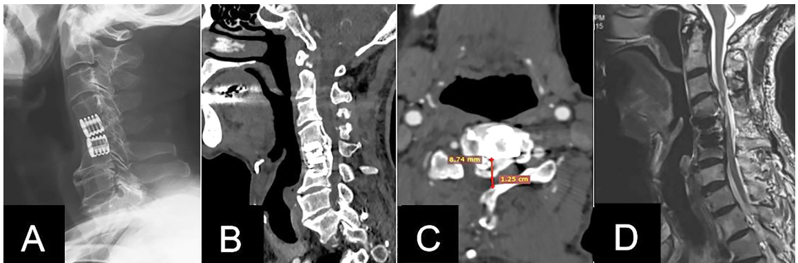
Figure 1. Preoperative Head and Neck Imaging: X-ray, CT, and MRI Images of the Patient.

with muscle strength of 3 out of 5 in the upper limb and 4 out of 5 in the lower limb. Muscle tone was observed to be normal, but superficial sensory abnormalities were noted in the right upper and lower limbs. The JOA score was 7. Further examination indicated increased right knee reflex and positive signs of Babinski's and Hoffman's on the right side. Radiographic evaluations, including X-ray plain radiograph and CT scans, demonstrated the post-ACDF changes, right C3-5 laminar decompression, cervical C4-6 continuous OPLL, C4-5 and C5-6 intervertebral cages collapsed posteriorly, and cervical kyphosis deformity (Fig. 1A, B, C). Furthermore, cervical MRI findings supported the presence of C4-6 cervical spinal stenosis (Fig. 1D).