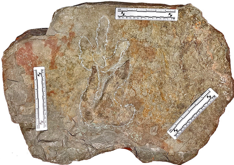
Figure 2. Photograph two theropod tracks from the Wanhailao site in Yunnan Province, China.

There are two unambiguous tracks designated as WHL T1 and T2, preserved as natural casts (Figs. 2&3, Table. 1). Both are interpreted as good footprints with an intermediate quality of preservation: i.e., ~ 2.0 on the four-point (0-1-2-3) scale of Belvedere and Farlow (2016). This score indicates that details of pad traces are present but not considered optimum preservation suitable for detailed ichnotaxonomy analysis. Part of track WHL-T1 overlaps WHL-T2. The claw marks of digit II in WHL-T1 extended to the posterior, proximal side of the digit II trace in WHL-T1. In addition, the impression of WHL-T1 is more profound than WHL-T2, presumably demonstrating different registration times for two footprints of similar size, not attributed to the exact trackway. If WHL-T2 was formed before WHL-T1, the substrate moisture content mushy has increased after the registration of T2.